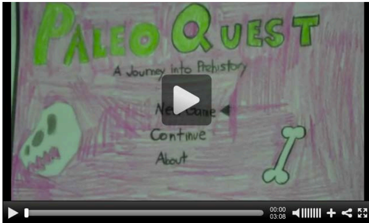
▶▶ Team Furyunleash22 learned to move from an idea to drawing a prototype. This interactive demo shows how the game will look and work.

On the other side of the state, in another school, Team Furyunleash22 , designed a game team members called Paleo Quest . Early in their game design process, these Globaloria students learned to draw their game concepts, videotape the concepts, and test their game structure with future players. Based on the critique they receive on their prototype, Team Furyunleash22 modified their ideas. They learned to move from an idea to drawing a prototype, then to designing an interactive demo that shows how the game will look and work.